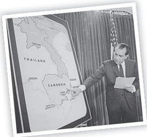
Crossing into Laos and Cambodia.

Cost: 1 RP. At the end of your turn, deploy (untried) any friendly CA and LA units from the Body Count Box to anywhere in their home countries.