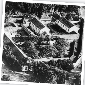
Hoa Lo POW prison in Hanoi.

Red Cost: 2 RPs. Move 1 Allied unit from the Dead Pool to the Body Count Box.