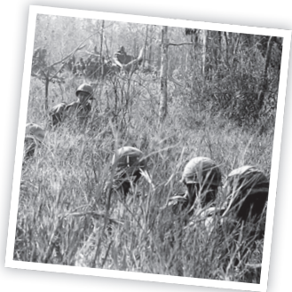
Cambodian (1967-75) and Laotian (1962-75) Civil Wars.

Add +3 to your total battle factors in one battle round if you attack in LA or CA and at least one friendly LA or CA unit participates.